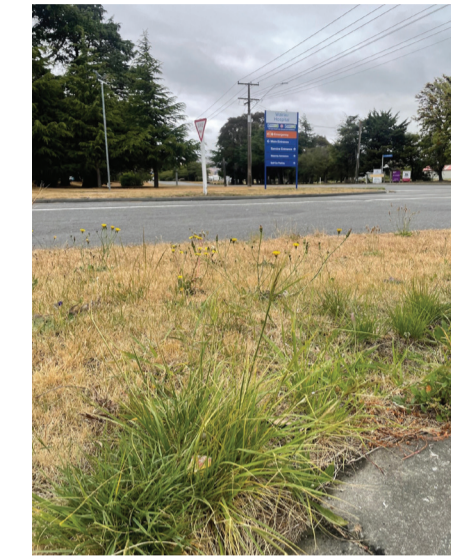
A new Chilean needle grass infestation in urban Blenheim

Anyone seeing suspected Chilean needle grass is urged to contact Council's Biosecurity team on ph; 03 5207400 as soon as possible.